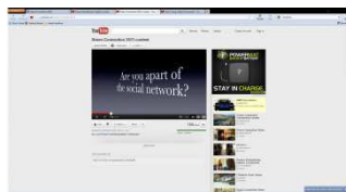
Green Connection Contest 2011 Par Sidney Gibson

http://www.youtube.com/watch?v=d8AjzBpgMmI&feature=youtu.be